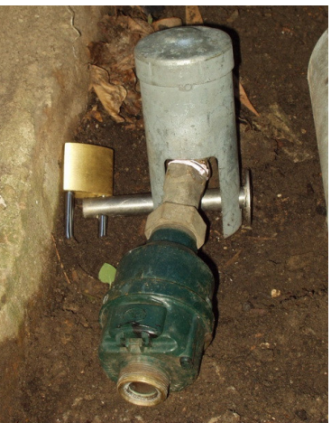
locked water meter

Sydney Water will add a note to the plan it has of your property saying "not connected" to alert buyers and builders that the property is not connected to Sydney Water.