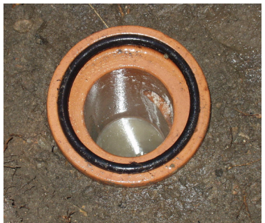
concrete in the gully trap

4. There is no Sydney Water fee. A licensed plumber must be present and will charge for what should be less than an hour of time, or less than $150 or so.